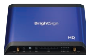
Expanded I/O Package