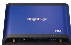
Standard I/O Package